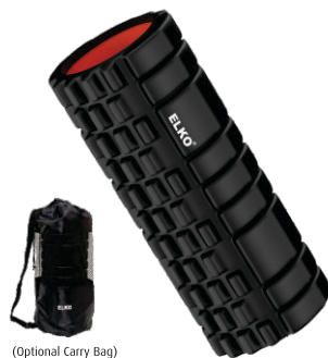
(Optional Carry Bag)